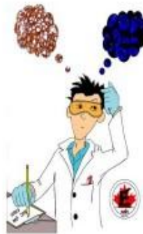
NSH REGION IX